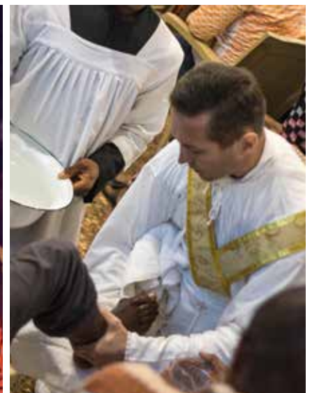
▲ Washing of the feet, Maundy Thursday