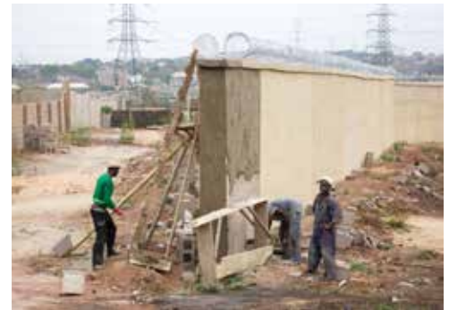
The construction of a wall around the site