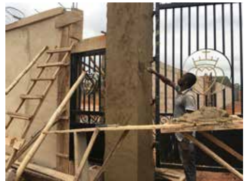
Finishing the gate