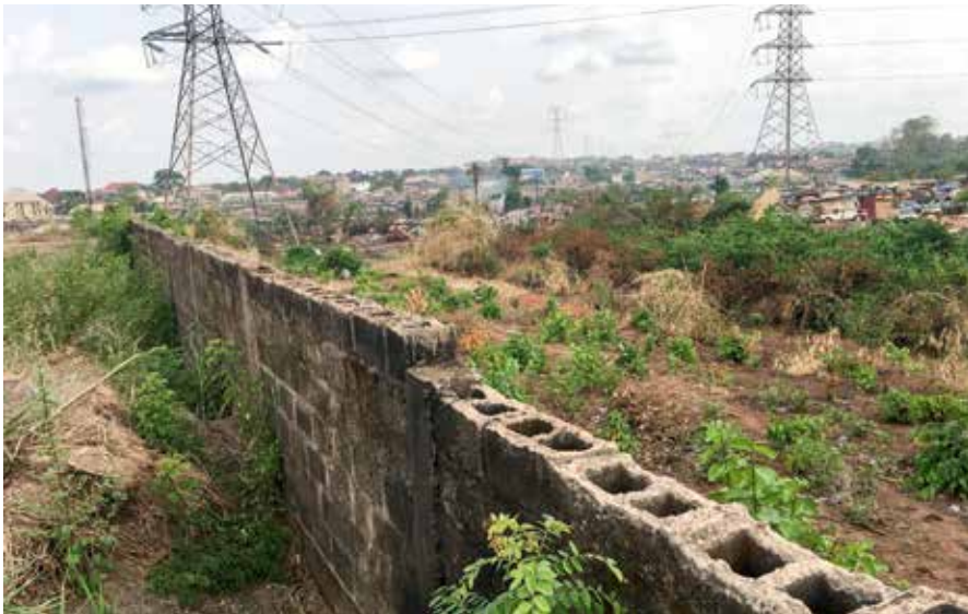
The old encircling walls in need of restauration