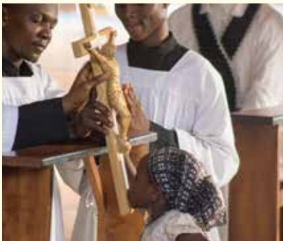
Adoration of the cross