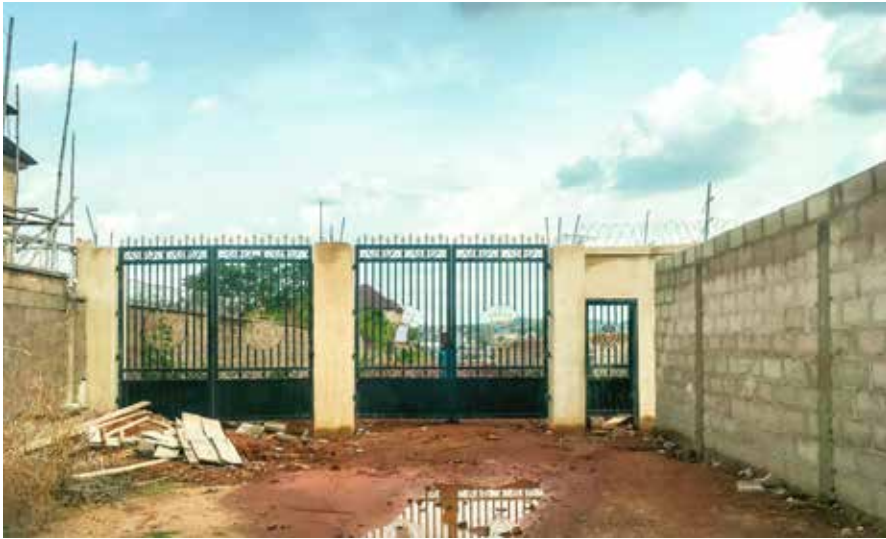
The entrance to the site with its splendid gate which has now been finished

Now the land has been bought, the work can finally begin.