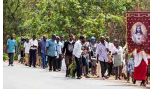
A procession in Enugu