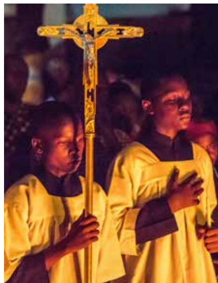
▲ The Paschal Vigil

We ask you this through the intercession of the Immaculate Heart of Mary