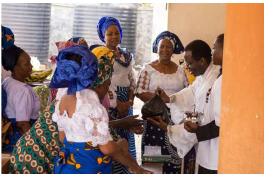
Procession of gifts after the Mass ▲