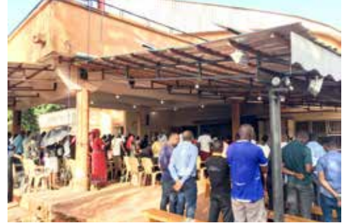
Mass in Enugu