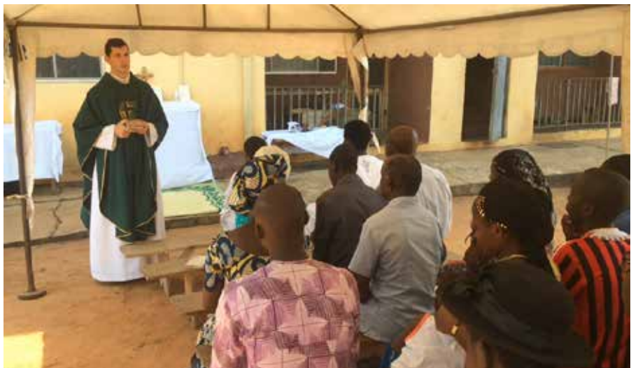
Beginning of the Mission ▲