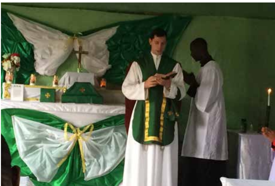
Mass in Lagos