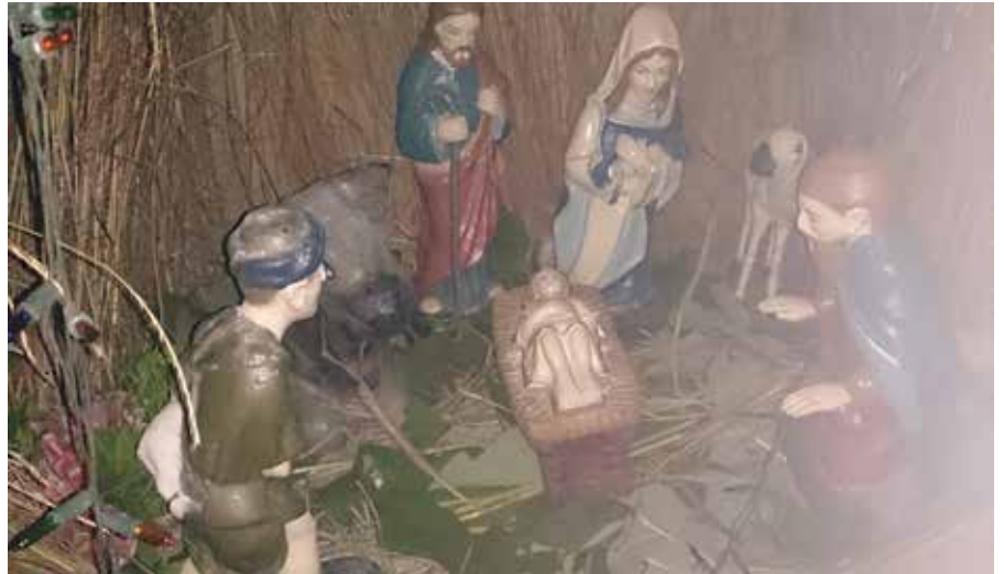
The crib in Enugu ▲

will not let us down. You can rely on our fervent prayers, and those of the Nigerians.