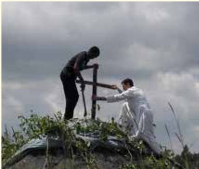
The cross will protect the land