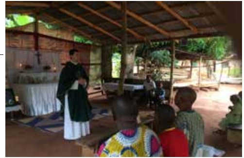
Mass in Achalla