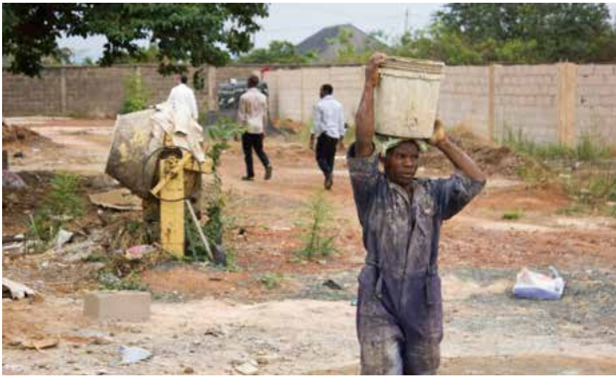
The workers building the fence