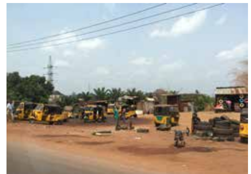
The famous taxis called «Keke»