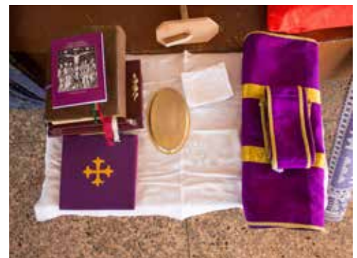
Preparation of the Mass