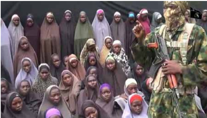
Abduction of girls in Nigeria ▲

Education, Christianity, the youth, femininity. The targets of Islamist movements in Nigeria are always the same.