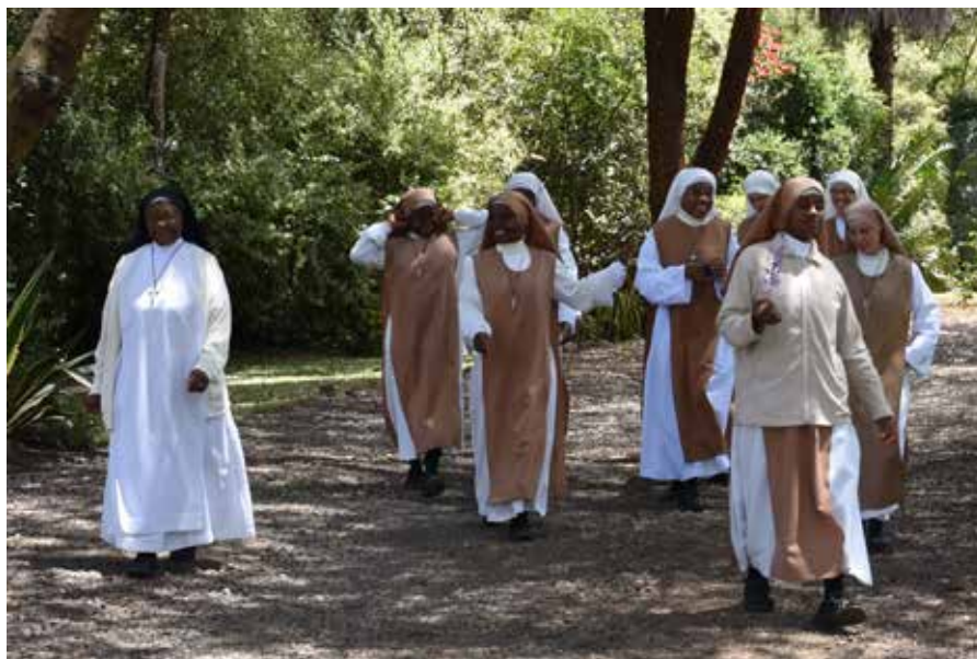
The missionary sisters of the Society in Africa ▲