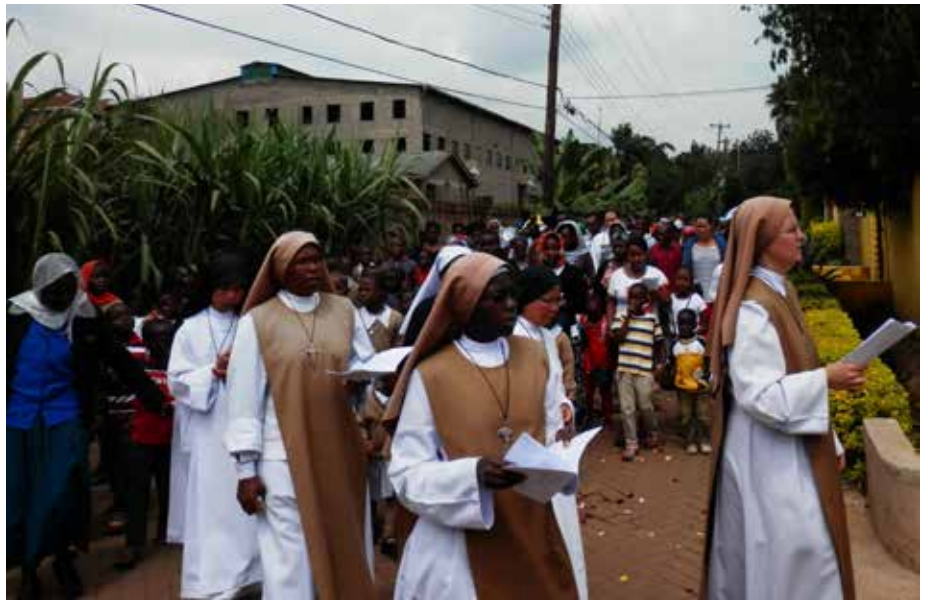
Procession of the sisters ▲

May this bulletin awake your charity for these poor faithful. As things stand, in spite of your generosity and that of our faithful, we haven't as yet raised the minimum requisite amount to start building. We are close, but not quite there. Therefore, as a good missionary, I take up my collection basket once more and I present to you our future "workers" who, once formed, will come to labour in the West-African vineyard. For now I hope, with your assistance, to be able to pay other "workers": those who are to very soon construct the apostolate ground for the aforementioned spiritual workers.... Among whom you are numbered!