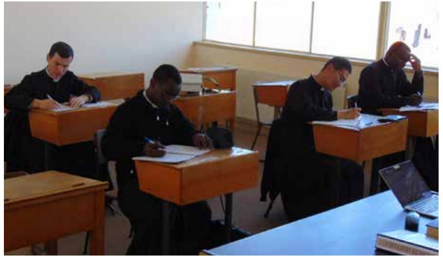
Seminarians under study ▲