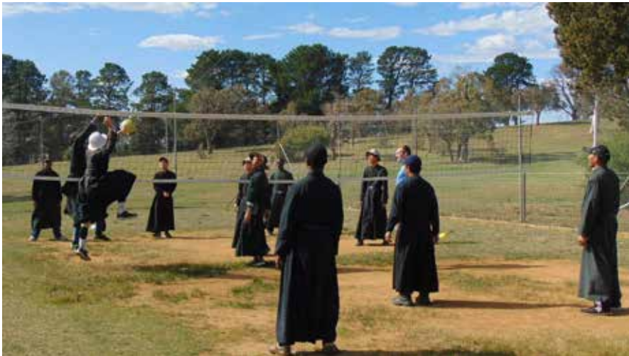
Recreation for the seminarians ▲