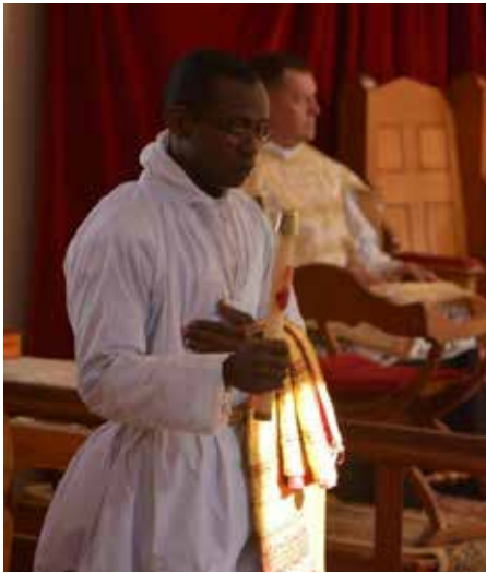
Our first Nigerian subdeacon ▲