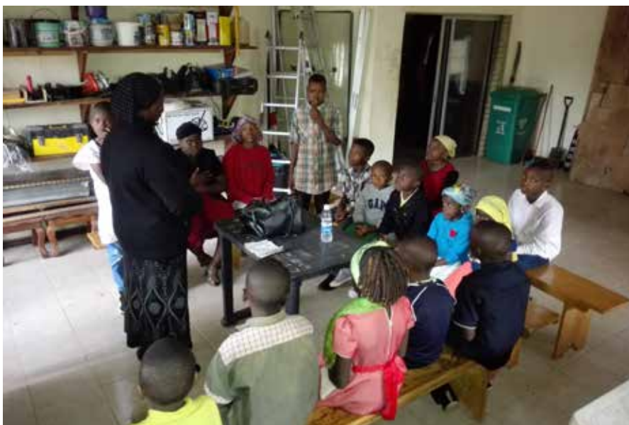
Preparation for the First Communion