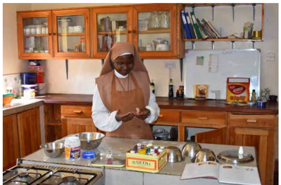
A sister cooking ▲