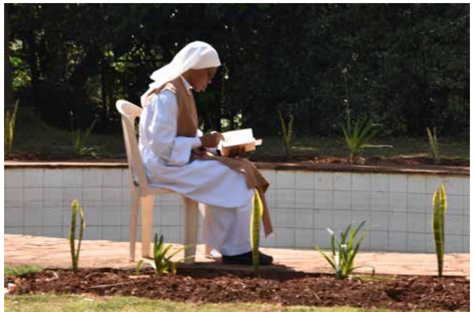
Spiritual reading in the garden ▲