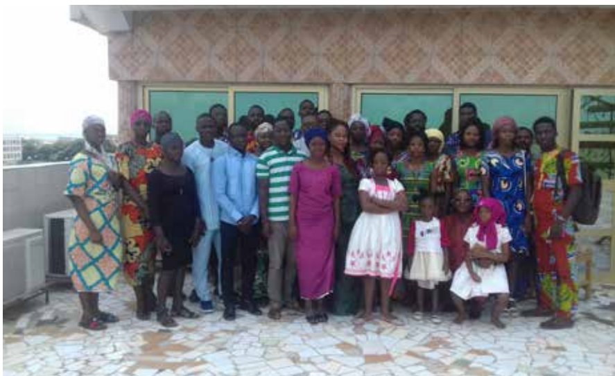
The faithful of Cotonou in Benin