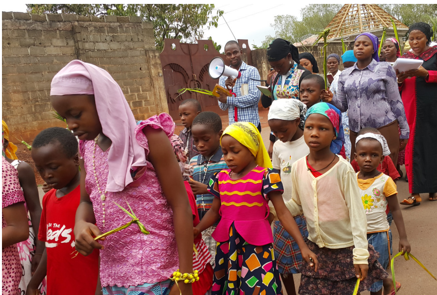
Procession in Enugu ▲