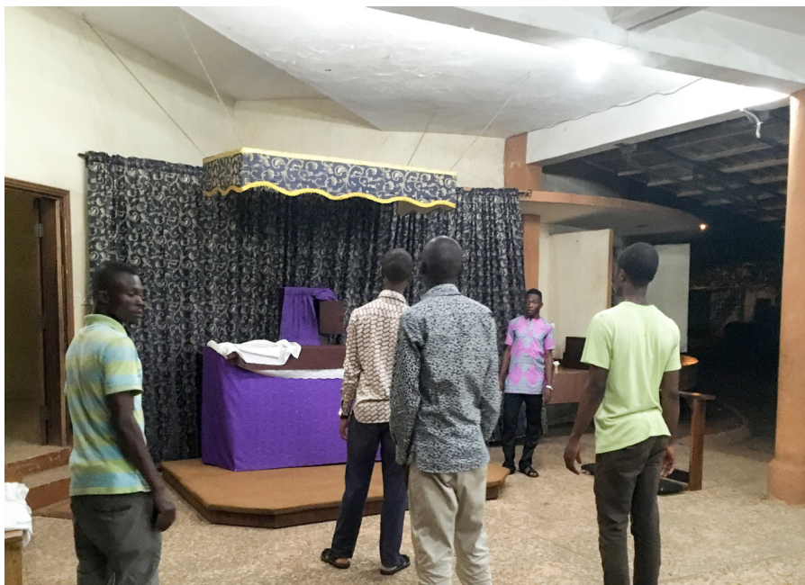
Catechism classes for young ▼