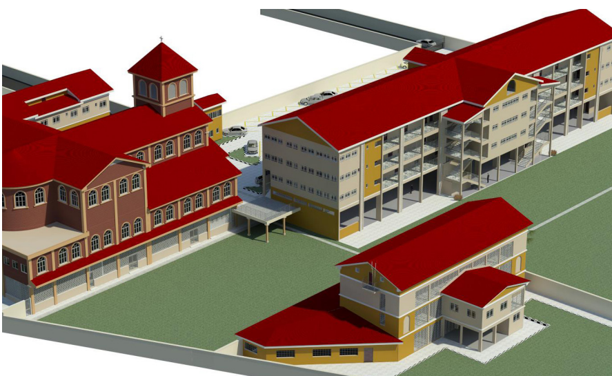
Future constructions of the Mission Saint Michel