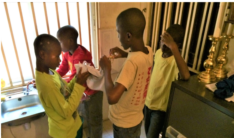
The choirboys ▲