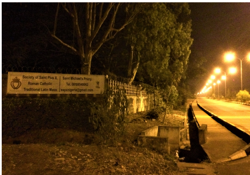
Umuawulu street ▲