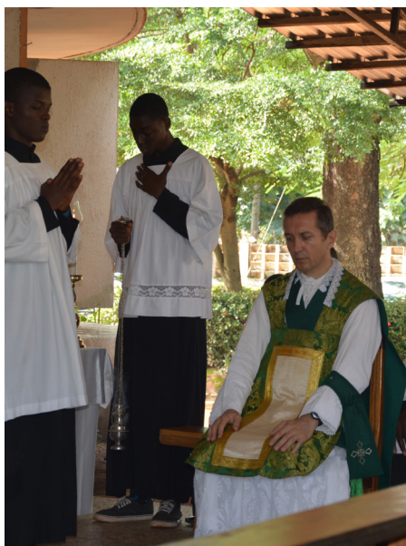
Mass in Enugu ▲