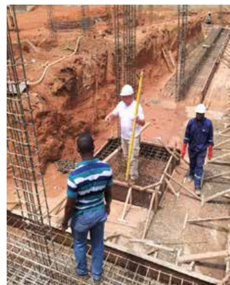
Project manager always present on site