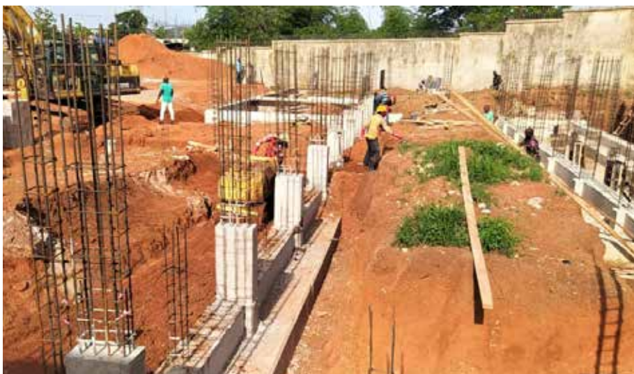
The works are not impacted by COVID 19