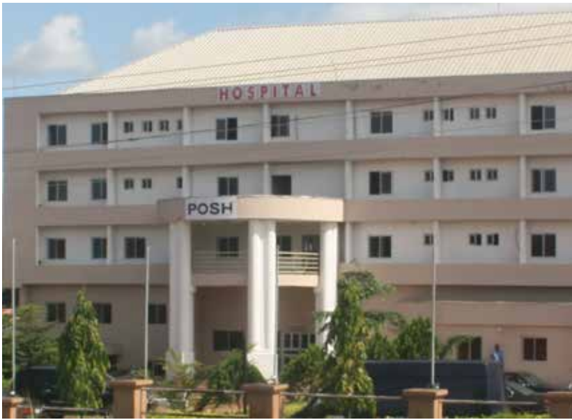
Enugu Hospital ▲