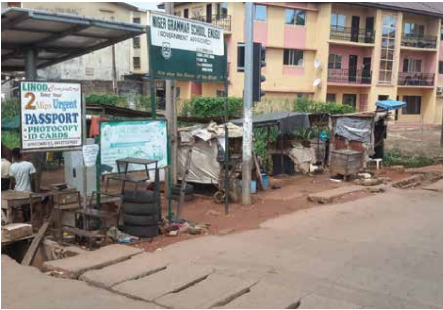
Enugu district ▲

Suddenly all was dark. The light seemed to vanish. Mickaël feels a terrible pain squeezing his head like a vise. His thoughts get confused. How strange! He hears the hurried steps of his attacker who runs away, leaving him there. These steps remind him of the heavy step of his father when he came home in the evening ... In a clumsy gesture, he feels around him. His bag is gone. This bag that contained his father's savings for a sunny day. There will be no sunny days, no Europe. This thought suddenly makes him shed a tear, it runs hot down his face ... hot? like blood! He suddenly realizes that blood is flowing, soiling his hair and rolling on the dirty dust of the road. He then tries to get up, but suddenly loses consciousness.