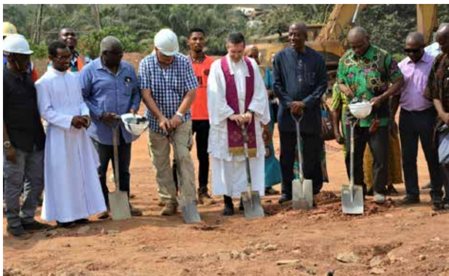
Blessing for the start of work