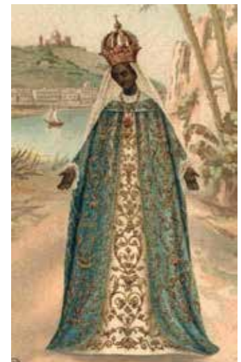
Our Lady of Africa ▲