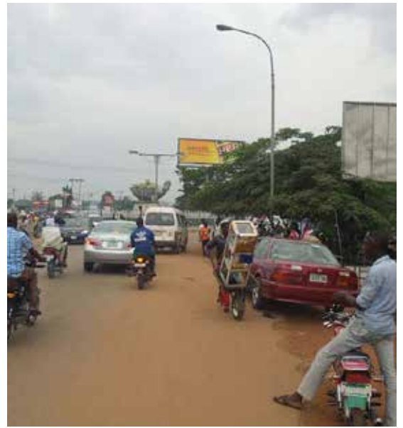
The streets of Enugu ▲