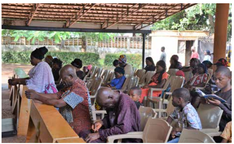
Rosary prayed before Mass at Enugu 🔺