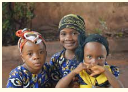
Future students 🔺