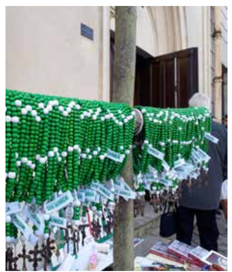
SOS Africa rosaries made by the Dominican students