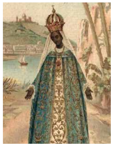
Our Lady of Africa 🔺