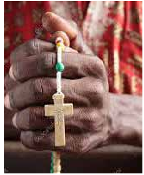
The example of the elders 🔺

A prayer crusade was launched by Fr. Davide Pagliarani, Superior General of the SSPX for the unconditional freedom to celebrate Holy Mass publicly and to attend it anywhere in the world, but also so that the Good Lord will bring forth ever more numerous vocations. It began on November 21, the feast of the Presentation of the Blessed Virgin in the Temple and will end on Mathdy Thursday (April 1, 2021) when we will celebrate the institution of the Holy Sacrifice of the Mass and the priesthood. I therefore encourage you to recite the rosary so that in Nigeria too, more and more young people will dedicate themselves to the God and participate in the apostolate of their compatriots. So do not hesitate to include this intention when meditating on this treasure which is the rosary. God will bless this effort.