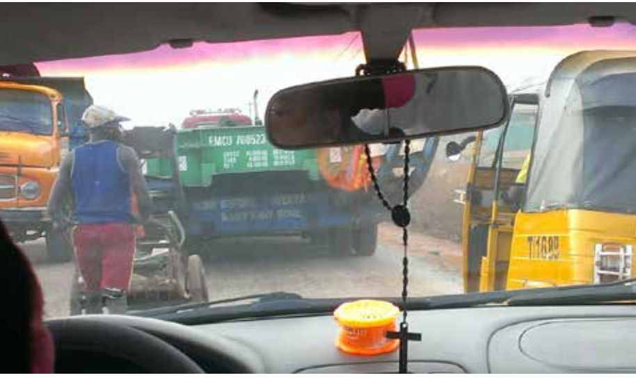
Rosary in automobiles 🔺